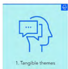
1. Tangible themes

The assessment takes place on two levels: for tangible subjects, e.g. the "forum", and for emotional (being) subjects, e.g. the "forum". On each level, all the participants have a blue dot to show where they think current collaboration is and then to put a green dot on their desired position. The assessments should be done quickly, based on gut instinct.